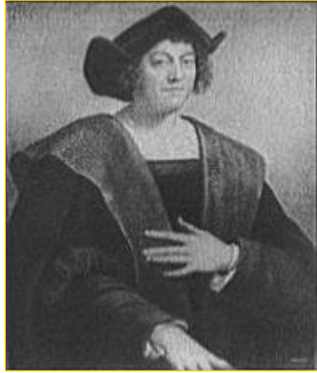
Group #1 = Columbus