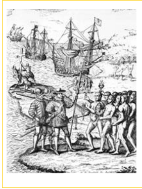
Group #2 = Natives